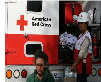
Help with food and supplies

Every minute of every day, we are there for you and the community. Come and be a part of this effort. Join us as we seek to serve the needs of the community. Not sure where to fit in? Take a look at the pictures here for ideas on how to partner with your American Red Cross.