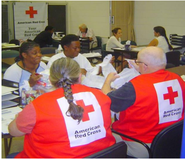
Help with client casework