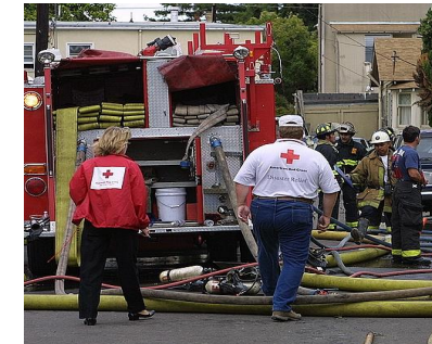
Help with fire response